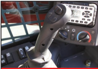
Pilot Operated Controls