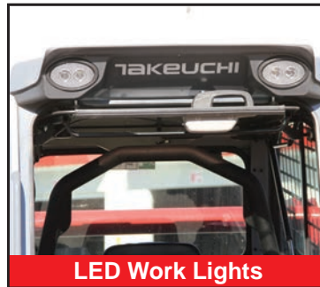
LED Work Lights