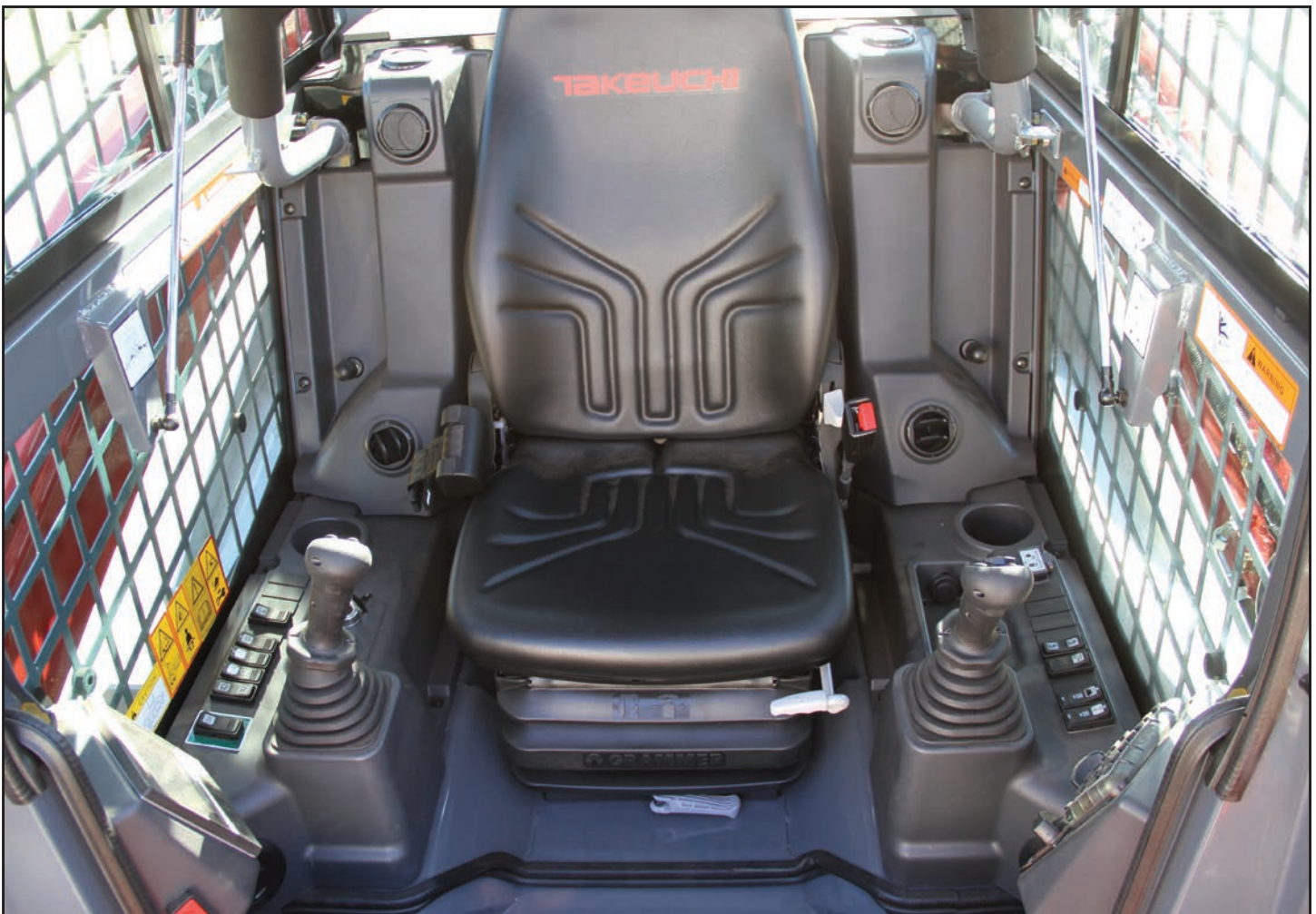
Spacious operator's platform with easy to reach controls and switches.

Equipped with the Takeuchi Fleet Management (TFM) telematics system critical information such as machine health, condition, diagnostics, and location can be viewed remotely providing valuable real time machine information that will help control costs and keep downtime to a minimum. The Takeuchi Fleet Management system is a real value as the service is free for the first two years of machine ownership.