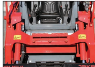
Lower Cross Member & Step