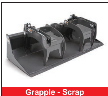
Grapple - Scrap

Takeuchi now offers attachments for all of your Takeuchi equipment. See your authorized Takeuchi dealer for additional information and attachment options.