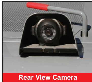
Rear View Camera