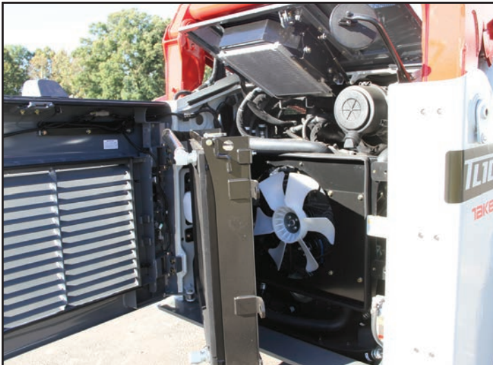
Convenient Service and Maintenance Access