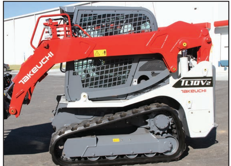
Vertical Lift Path for Balance and Stability