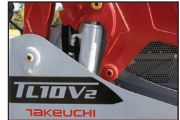
Oversized Lift Cylinders

The TL10V2 vertical lift track delivers excellent functionality, performance, comfort, and serviceability. It features a completely redesigned operator's station with a 5.7" color multi-information display and updated rocker switches that control a wide range of machine functions. Cab models have a smooth, low effort overhead door that improves entry and egress and enables the loader to be operated with the door in the raised or lowered position. An updated undercarriage with a wide block quiet ride track system provides better flotation, improved ride quality, and a reduction in noise and vibration. A powerful 74.3 horsepower engine meets the latest