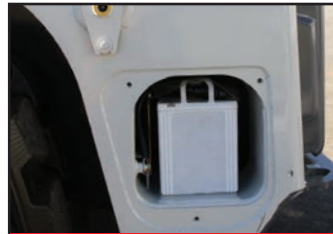
Battery Access Panel